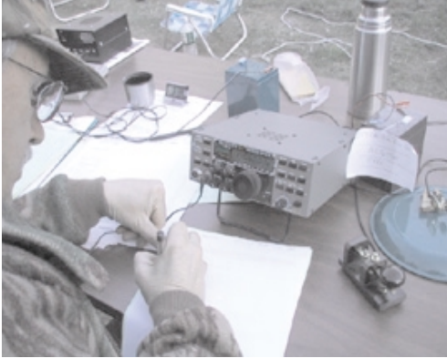
Close-up of Rich's "K2."

Friday before the contest. Using a bow and arrow, they were able to get a rope up across the field at about 60 feet high. This rope served as the support for two dipoles. One was 66 foot long and fed with 300 ohm window line and the other a 100 footer fed with 300 ohm TV ribbon cable. These were our main antennas.