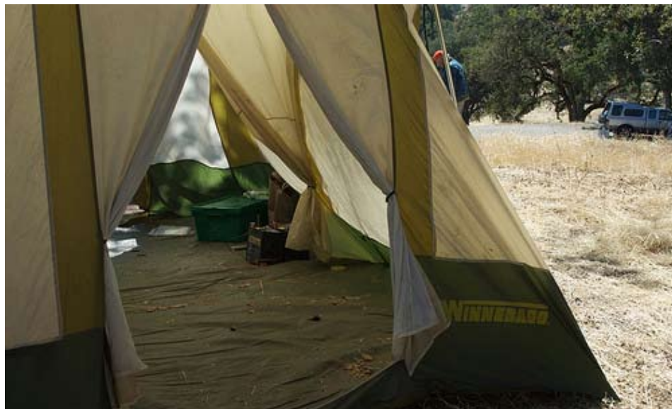
The operating tent was on the San Benito, SBEN, side of the county line according to Google Maps. K6WC was in San Benito county